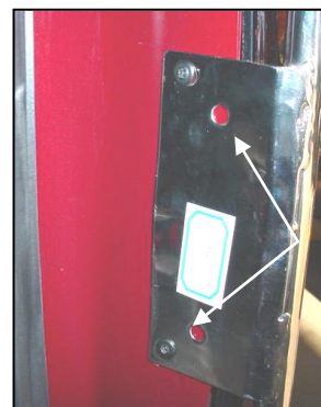
Optional Drilling Locations

Cleaning Instructions: For stainless steel, an aluminum polish may be used to polish small scratches and scuffs on the finish. Mild soap, window and glass cleaner may be used to clean stainless steel. For gloss black: Mild soap, window and glass cleaner may be used. Do not use any type of polish or wax that contains abrasive that could damage the finish.